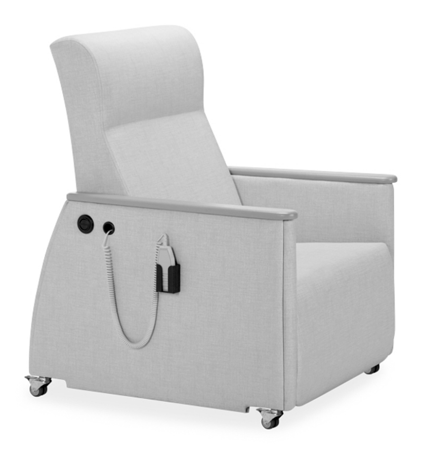
Connect I - Motorized recliner with vertical lift to exam height

Featuring a motorized mechanism that can be reclined to any position, including flat and has a vertical lift feature.