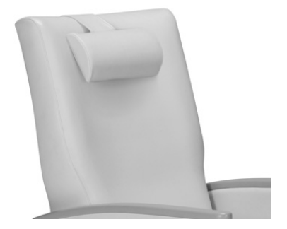
flared back 628-F