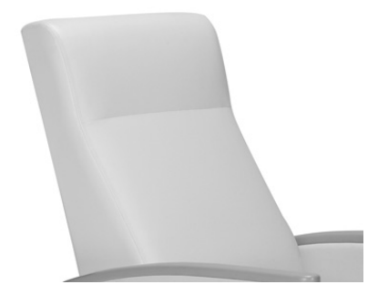
straight back 628-S